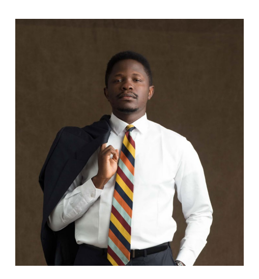
UKWA NKEM PARTNERSHIPS