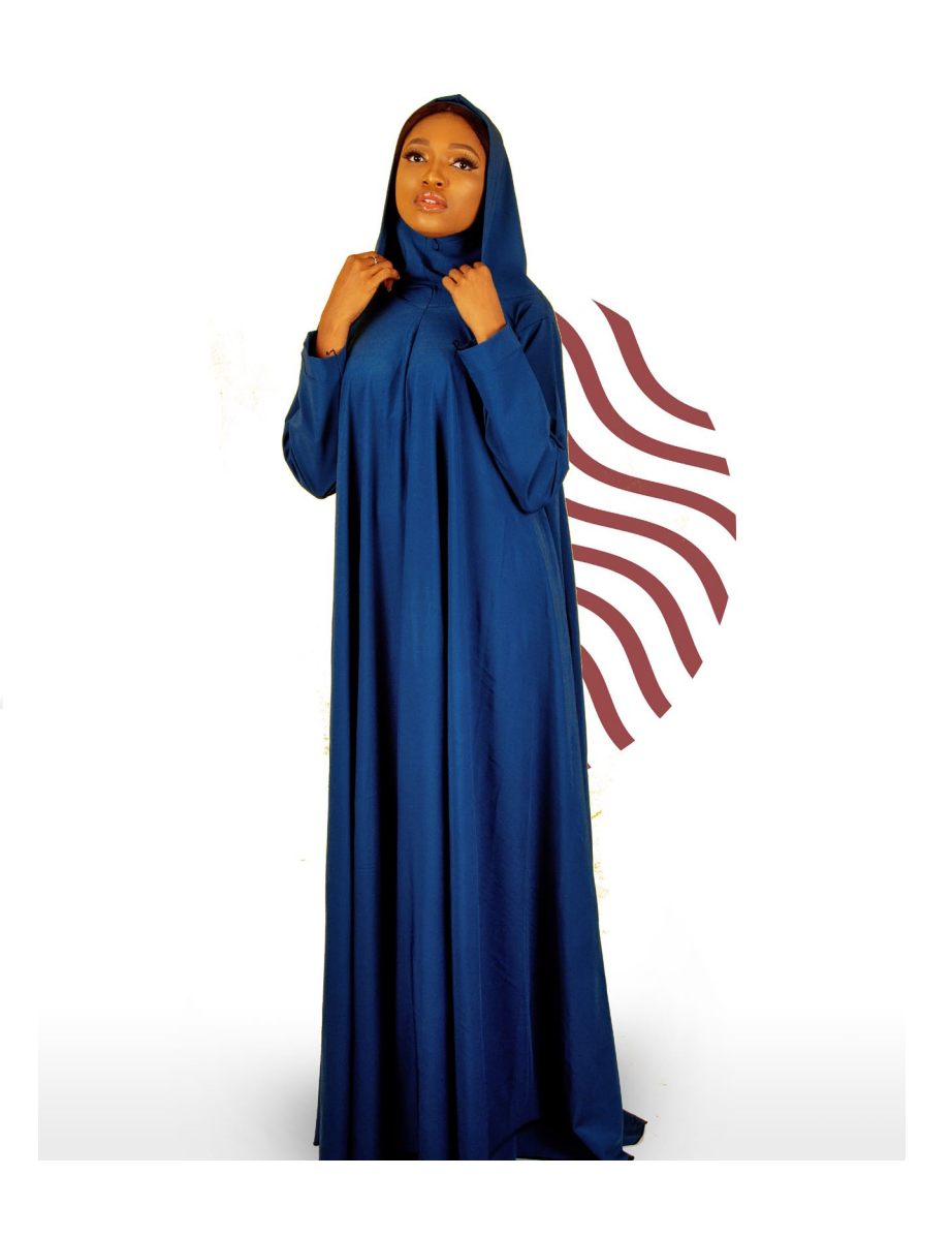
FABRIC Lycra, Cotton Poly Mixed