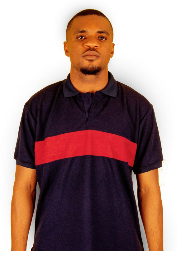
FABRIC Lycra, Cotton Poly Mixed